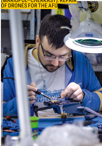
HALABUDA EDUCATIONAL HUB (MARIUPOL-CHERKASY): REPAIR OF DRONES FOR THE AFU