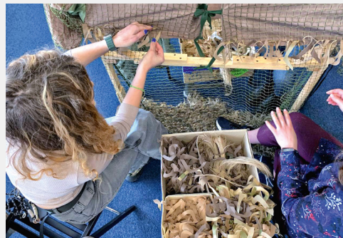
PECHERSKI KOTYKY VOLUNTEER COMMUNITY (KYIV): MASTER CLASS ON WEAVING CAMOUFLAGE NETS